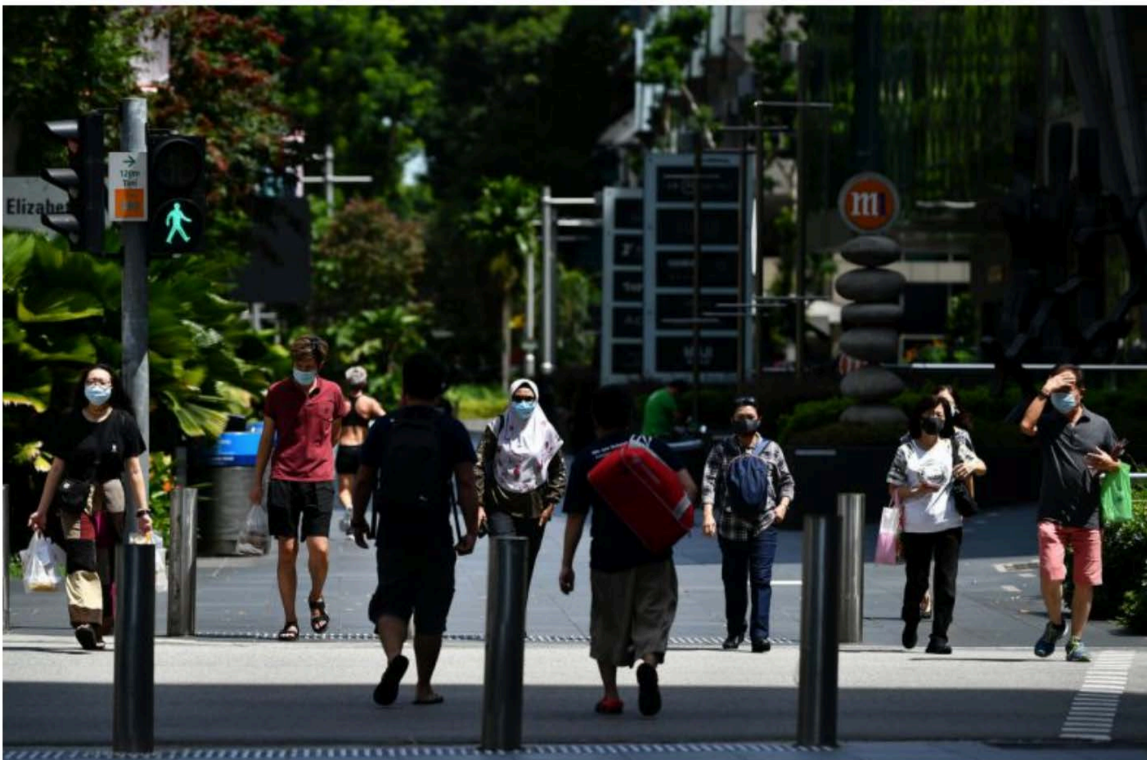
There is still considerable uncertainty and the country must be prepared for more retrenchments, said a Ministry of Manpower official.